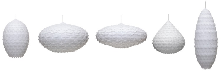
Hs1 Hs2 Hs3 Hs4 Hs5